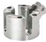
F3 Attachment-A89-4 10.00 kg Item No. 21906