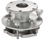
F3 Attachment-E140 10.00 kg Item No. 21901