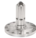
F3 Attachment-Q60 4.00 kg Item No. 27133