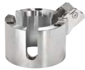
F3 Attachment-A114-3 8.40 kg Item No. 21907