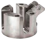
F3 Attachment-A76-4 10.60 kg Item No. 21905