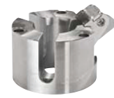
F3 Attachment-A76-3 11.70 kg Item No. 21903