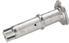
F3 Attachment-P89 7.00 kg Item No. 21904